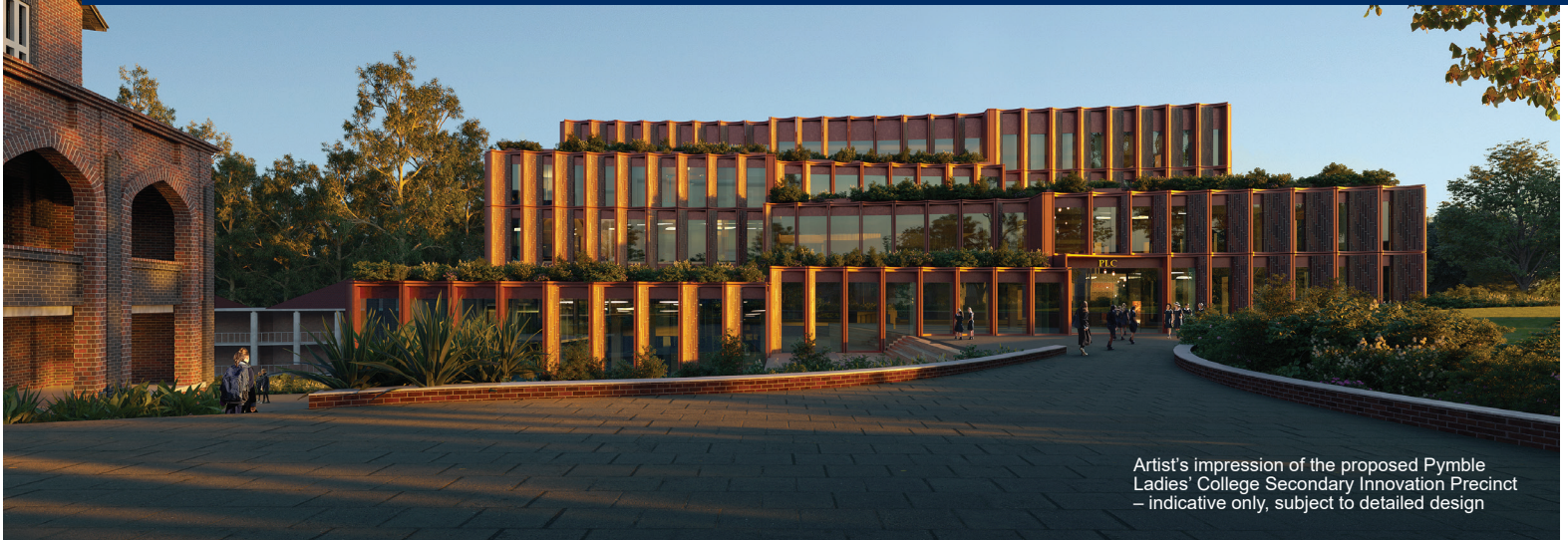
Artist's impression of the proposed Pymble Ladies' College Secondary Innovation Precinct – indicative only, subject to detailed design

Pymble Ladies' College is in the early stages of developing a Secondary Innovation Precinct within its main campus at Avon Road, Pymble.